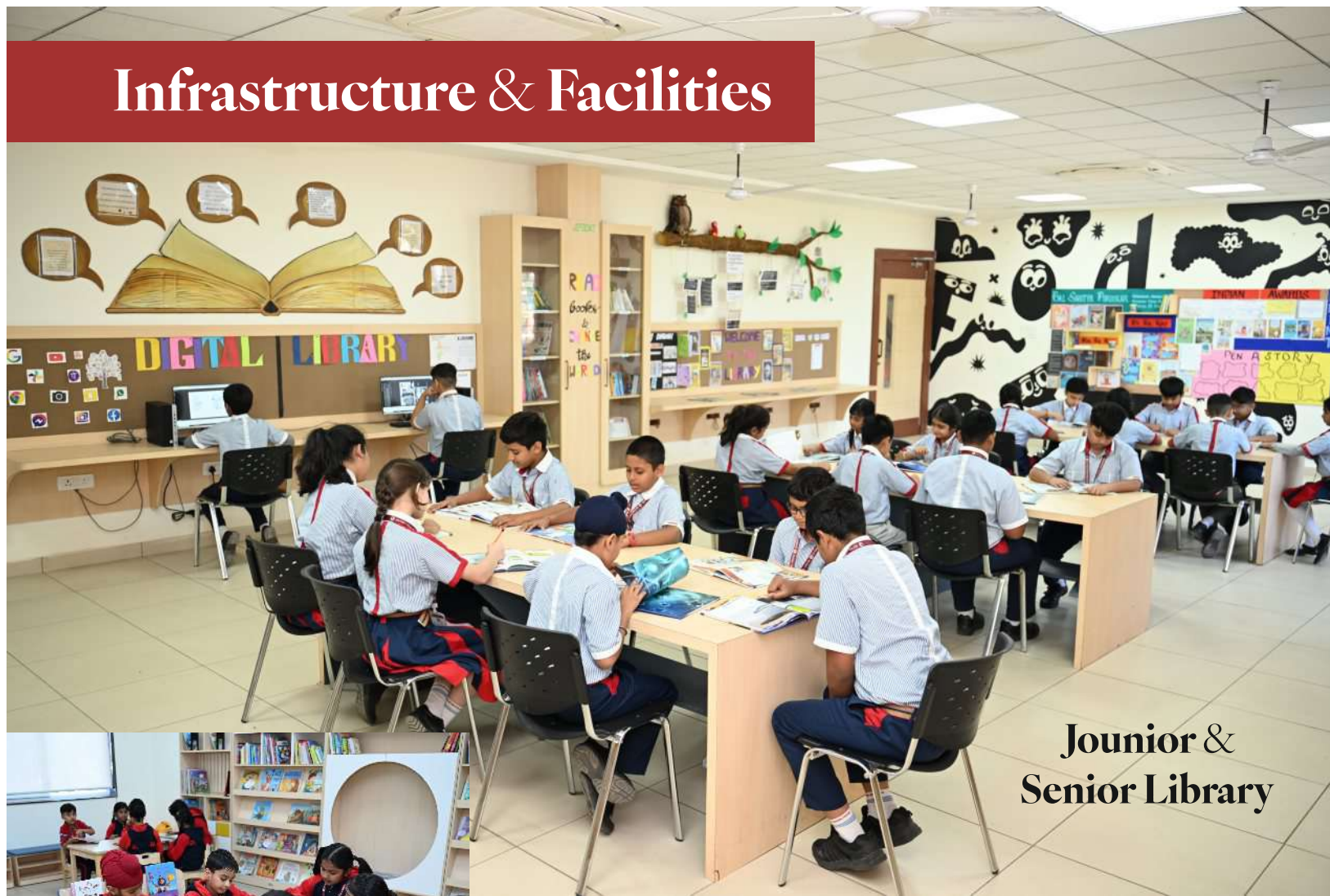
Jounior & Senior Library