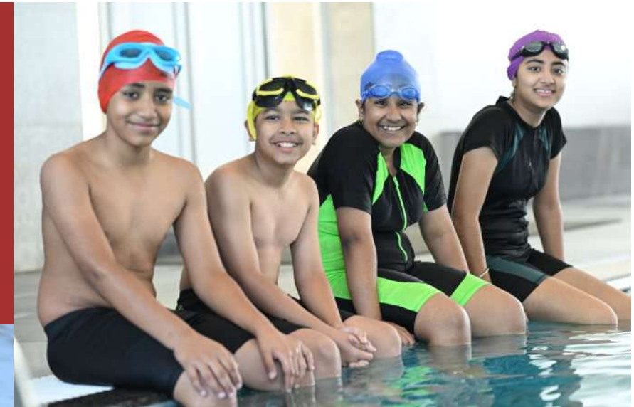
SEMI OLYMPIC SIZE INDOOR SWIMMING POOL

A special sports programme has been introduced for toddlers for their Motor Skills Development.