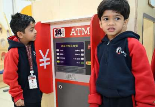
Soft Play Area