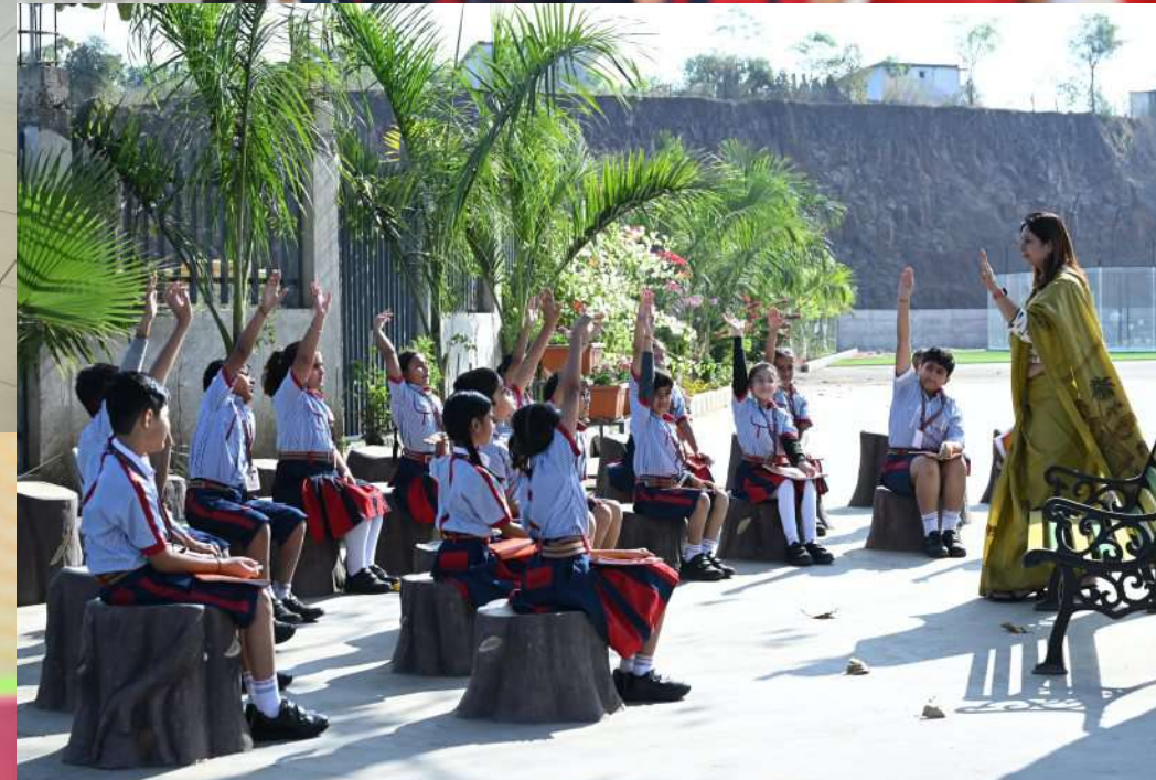
Outdoor Play Area