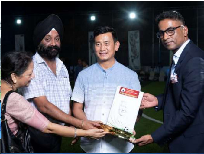
MR BHAICHUNG BHUTIA INAUGURATING GD GOENKA SPORTS ACADEMY